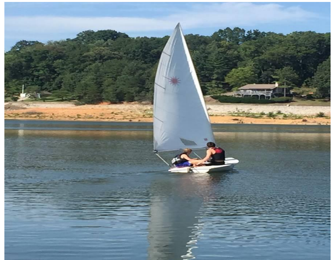
THE "USS ARI PHOUTRIDES" UNDERWAY