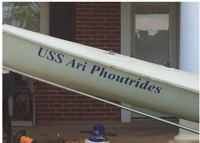
"THE PHOUTRIDES" UNDER CONSTRUCTION