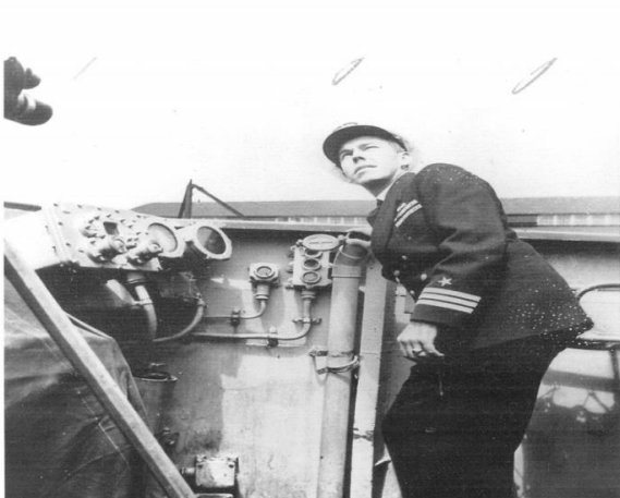
EDITOR'S REUNION COMMENT

Sign up early for the Memphis 2017 Reunion to get the room of your choice!