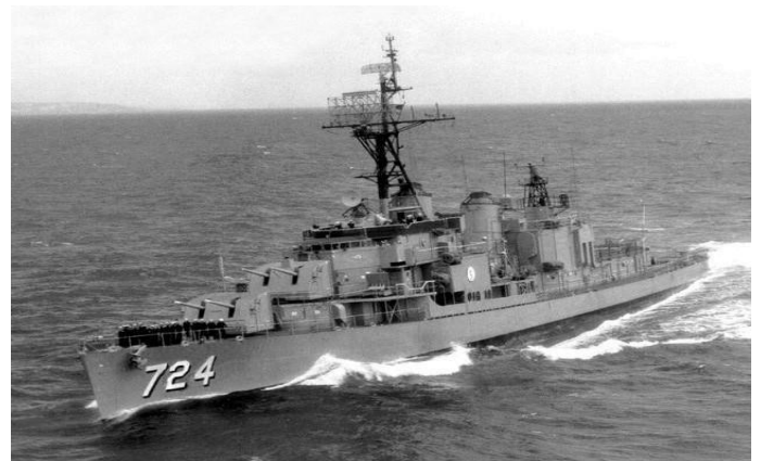
THE LAFFEY "AT SEA"