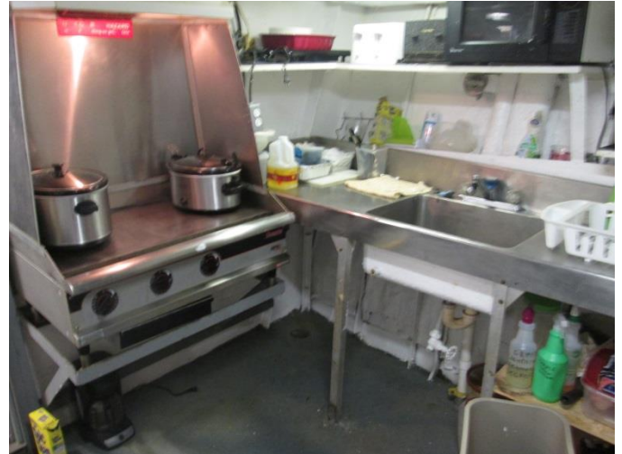
The ship's galley – Where good food is served!