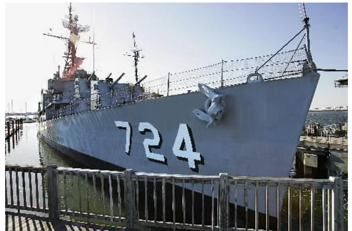
THE LAFFEY "IN PORT"

Please contact the Sheraton Downtown directly at 901-527-7300 to reserve your room. The room rates are $119 per night (plus taxes). Make sure to mention "The USS Laffey".