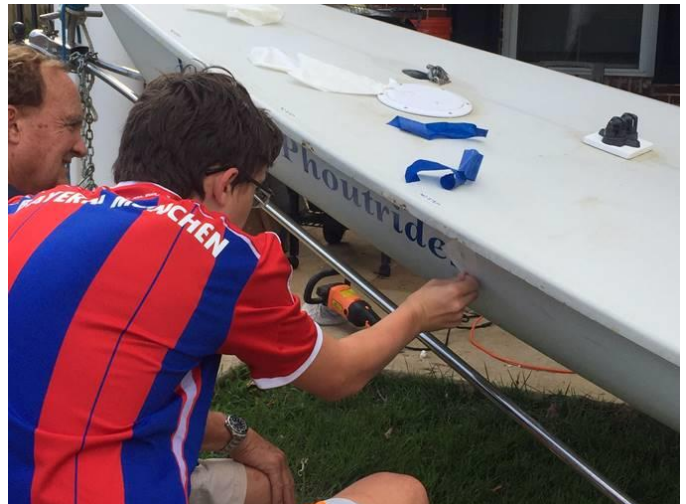
"THE "SHIPS NAME" IS REVEALED