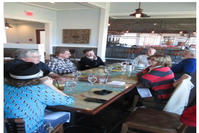
Meet & Greet Luncheon with PP People