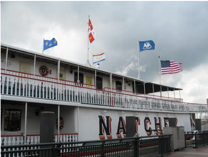
Our "cruise ship"...The Riverboat Natchez