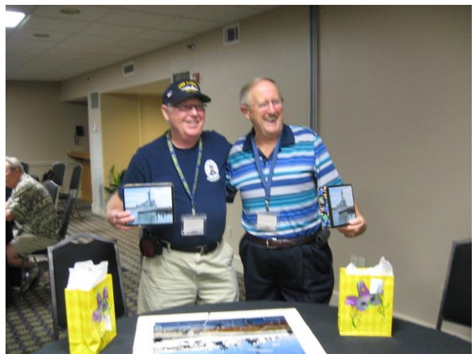
The great puzzle contest victors – Well done!