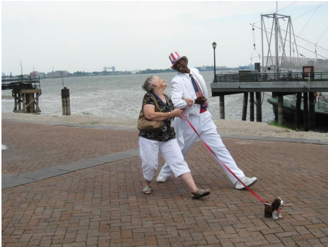
Just taking the puppy dog for a walk!