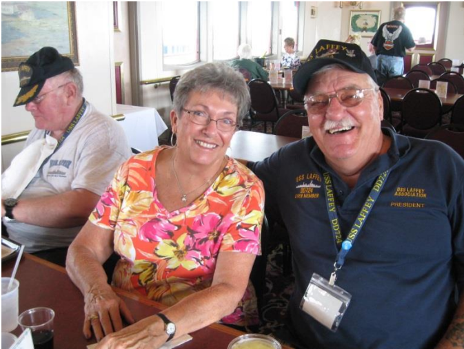
Sonny and Cher Enjoy a Lighter Moment