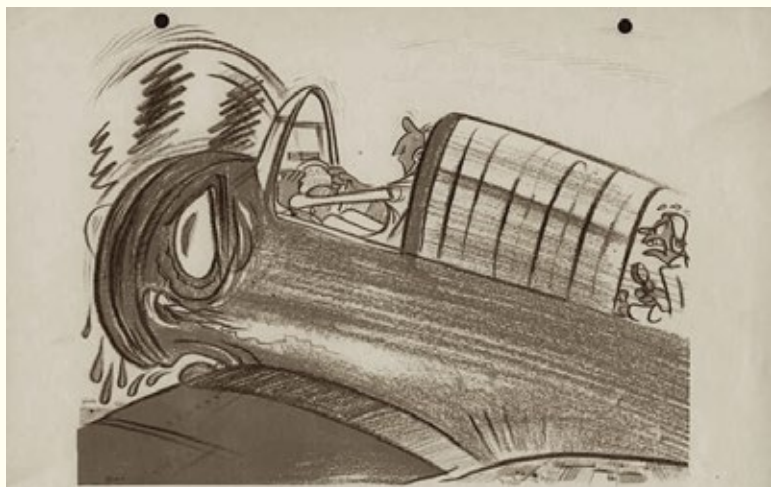
Don't use full throttle ALL the time just because you like the ROAR!