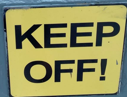
Plaque on Mount 53