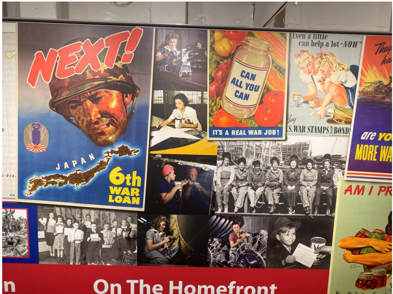
WWII Posters Showing Women Supporting the War Effort